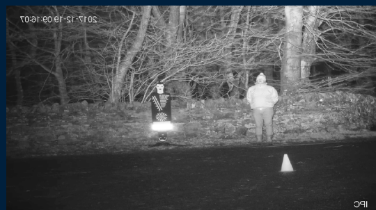
With IR on