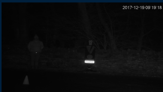
Without IR on