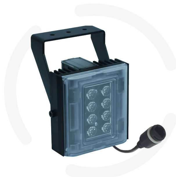
Interchangeable Diffuser Lens