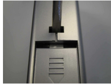
Fig.4. Removing battery compartment cover

First fit a PP3 battery into the WalkTester battery compartment (Fig.5 & Fig.7). This is done by removing the battery compartment cover as shown in Fig.4. Please ensure that the on/off switch on the WalkTester is set to the 'off' position while connecting the battery (Fig.6). When fitted close the battery compartment and the WalkTester is ready for use (Fig.8).