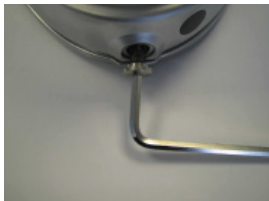
Fig.9. D-TECT cover and screw

Remove the cover from the D-TECT housing by loosening the stainless steel screw at the bottom of the D-TECT (Fig.9). This will allow access to the programming button shown in Fig.10 (and to also verify the presence of the Blue IR Emitting LED).