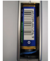
Fig.7. PP3 battery fitted