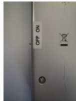
Fig.6. On / Off switch