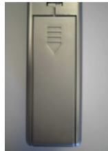
Fig.8. Cover replaced