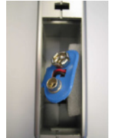
Fig.5. PP3 battery connector