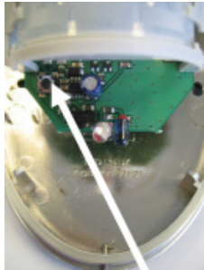
Fig.10. D-TECT programming button

Place the D-TECT into 'walk test' mode by pressing the program button once (Fig.10). The D-TECT's LED will then flash out its current settings. Wait for the flashing sequence to finish. The D-TECT is now in walk test mode and will remain in that state for five minutes after the last detection, where after it will revert to normal mode. Walk test can be cancelled at anytime by pressing the D-TECT program button twice.