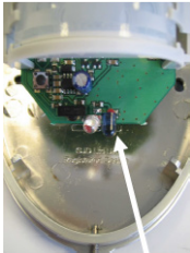
Fig.1 D-TECT IR emitter

*Please note that some of the earlier versions of D-TECT's were not fitted with IR transmitters and so the WalkTester will not work with these units. To verify please take the cover off the D-TECT and look at the **bottom of the circuit board for a blue IR LED (Fig.1). If this is present then the WalkTester will be able to communicate with the D-TECT.