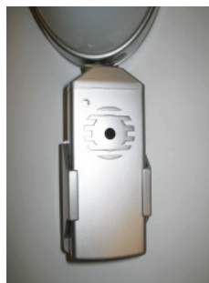
Fig.11 WalkTester in holder and fitted to D-TECT, ready for walk testing

Slightly loosen the stainless steel screw on the bottom of the D-TECT, just enough so that the drilled tab on the WalkTester bracket can slide around the screw thread. Then gently tighten the screw to hold the WalkTester and holder in place (Fig.11). Note the WalkTester can be orientated around the base of the D-TECT detector within 180 degree so as to allow for visibility during walk testing. Turn the WalkTester on.