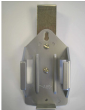
Fig.2 WalkTester holder & bracket