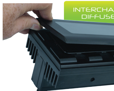
INTERCHANGEABLE DIFFUSER LENS