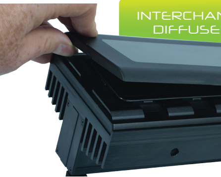
INTERCHANGEABLE DIFFUSER LENS